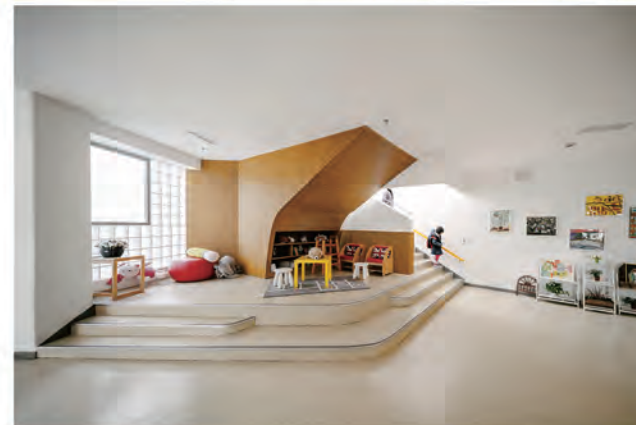
半围合空间、室外楼梯和东侧的运动场地 Semi-enclosed space, exterior staircase and playground on the eastern side 主楼梯间在底层被放大，增加活动和交流空间 Enlarged staircase on the ground floor to increase outdoor space for activity and communication