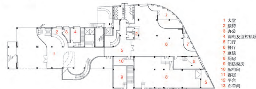
二期一层平面 / First Floor Plan of Phase II