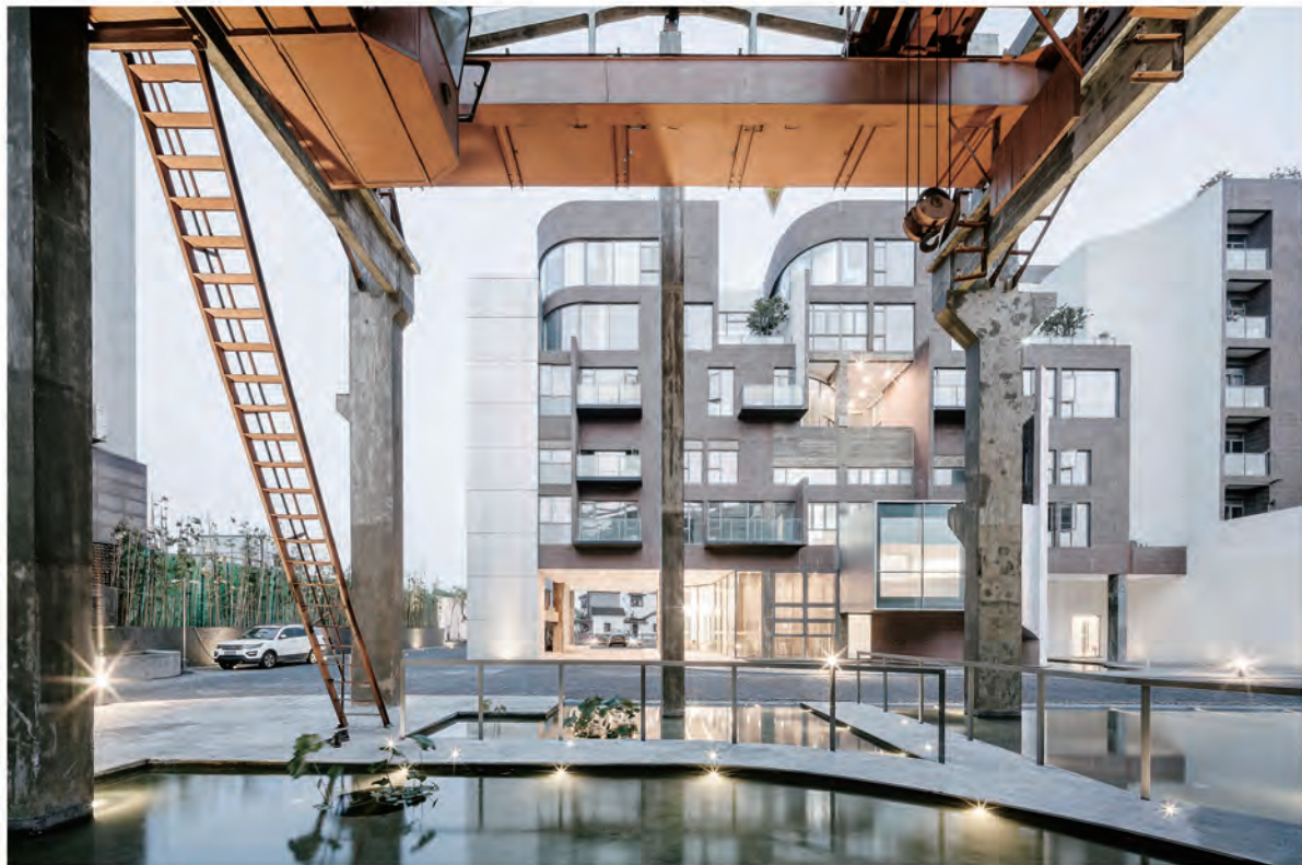
从一期西侧的工业构架看向二期，工业遗存是场地的景观焦点 / View towards Phase II from industrial frame on the western side of Phase I