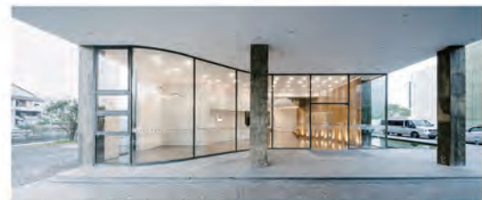
一期西区北立面 / Phase I north elevation of west district

申窑艺术中心是对上海嘉定京沪高速旁、一组 1990 年代的工业车间和辅楼进行的全面改造与更新。方案取“素胚瓷片”为概念，抽离出来的片状弧面形成了建筑外立面的原型母题和主展厅的基本语汇。一期设计保留了原有的建筑结构和场地关系，但通过内部钢结构夹层的增量，原空间的工业属性被赋予了新的艺术氛围及业态内容。封闭的庞大车间体量被打开，新置入的景观连廊和玻璃天棚让园区的前后场地被连接，室内空间得以更好地被入驻企业及人群所使用。