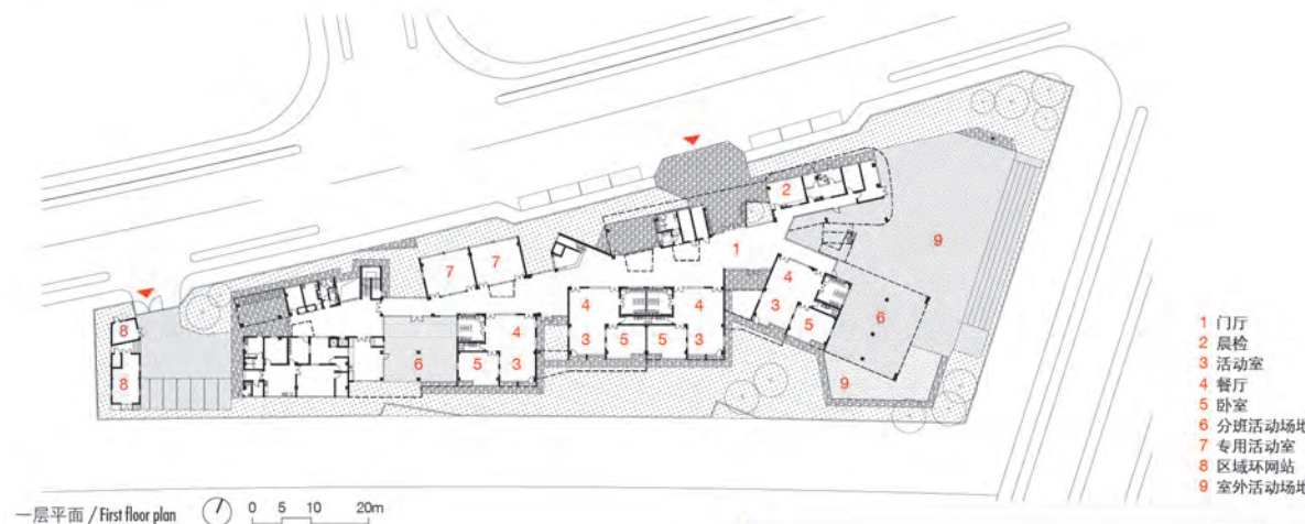
一层平面 / First floor plan 0 5 10 20m