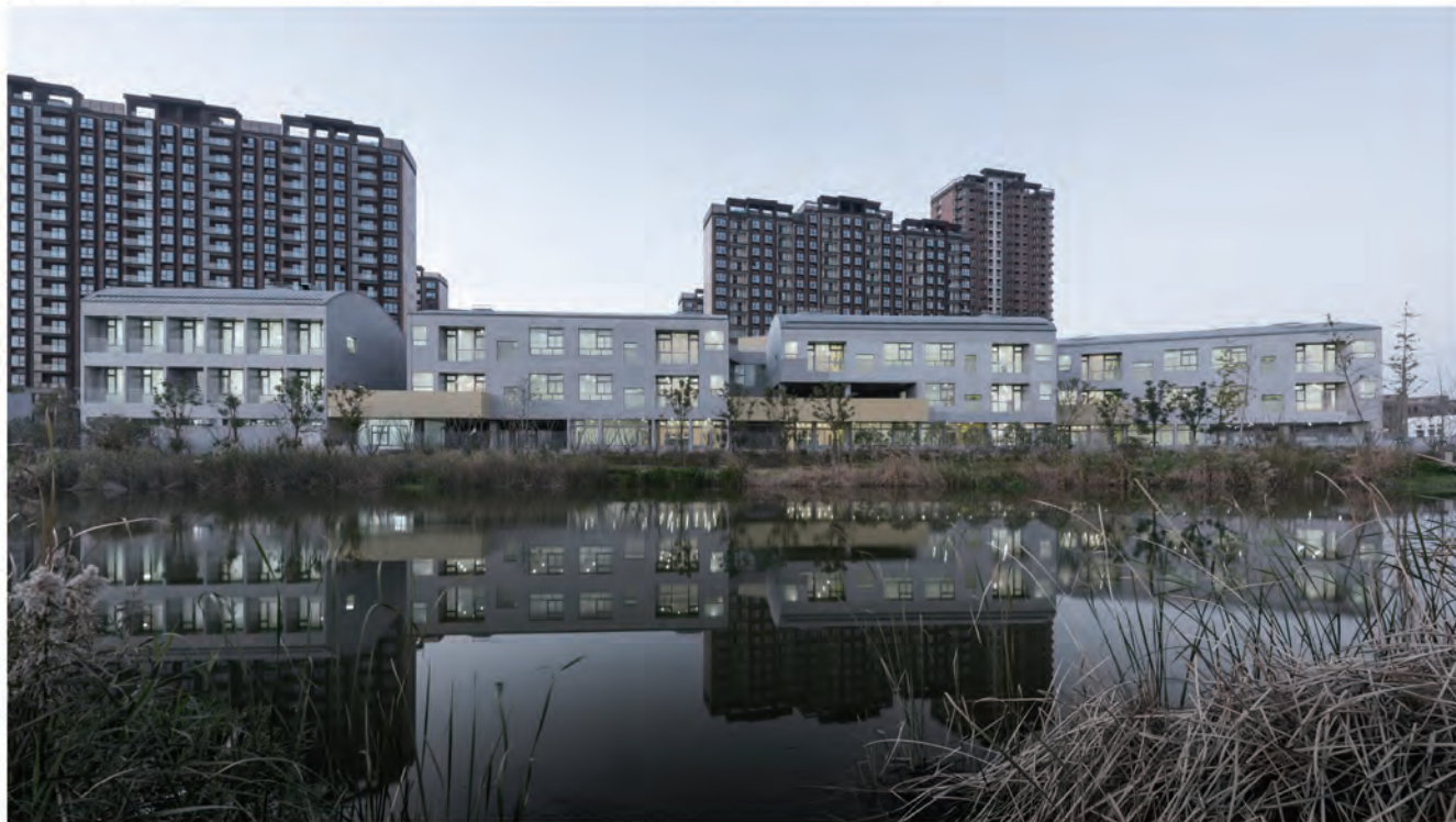
从河南侧遥望幼儿园 / Remote view of the Kindergarten from south of the river 东北向鸟瞰 / Northeastern bird view