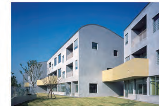
南侧的集中绿地和连廊串起的建筑体量 Concentrated greenery on the southern side and architectural masses strung up by the corridor