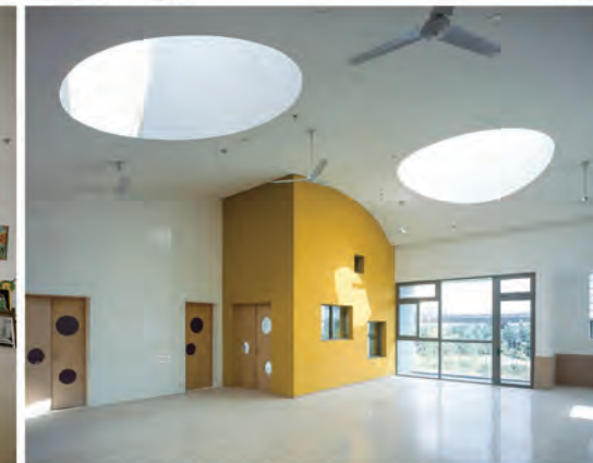
走廊中透过玻璃砖的柔和光线 Soft light penetrating through glass bricks on the corridor 活动室内部：天窗与多种材料 Interior of the play room: skylight and multiple materials