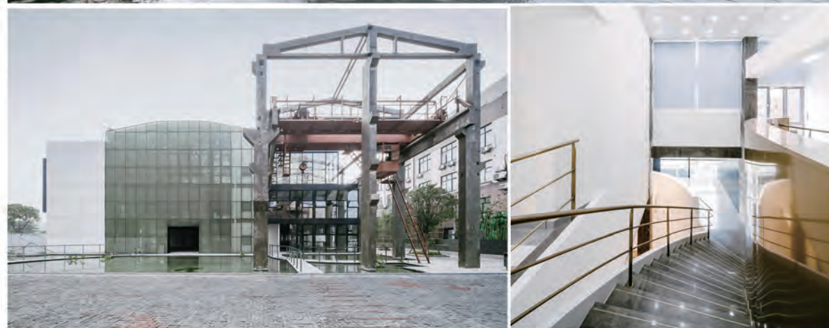
二期北侧沿河外景 / Exterior view of the northern side of Phase II 一期西立面，西侧凸出体量的外墙拆除，裸露出工业架构 Western elevation, demolition of extruded wall on the western side exposed the industrial frame