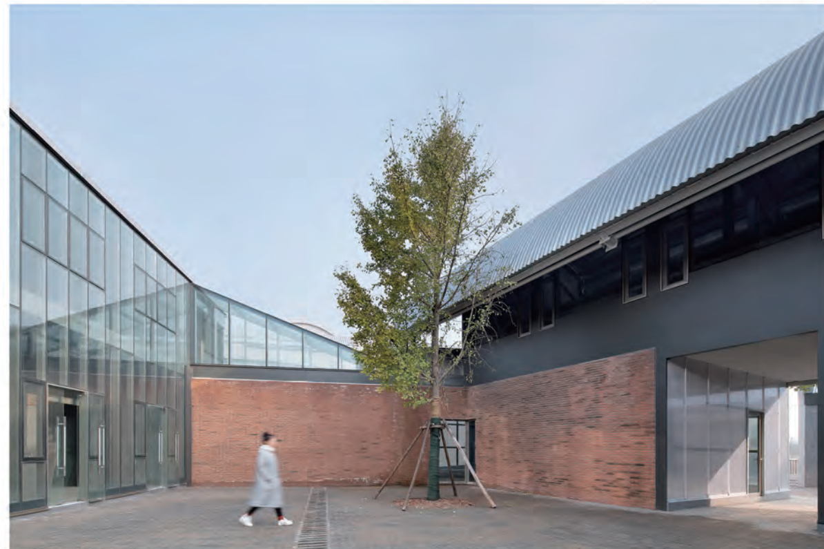
酒店内院多种材料的对比, 玻璃幕墙、红砖、深灰色钢板与银色波纹钢板屋面 Contrasts of various materials in the inner courtyard of the hotel: glass curtain wall, red bricks, deep grey steel panels and silver corrugated steel panels on roof

本项目的基地介于北京东四环与东五环之间, 被纵横交错的数条铁轨所割据, 随着城市迅猛扩张, 其逐渐被孤立、被遗忘。建筑师看到的是破败仓库藏匿下的一片原始生机, 占卜到的是一方城市荒漠中的秘密花园。