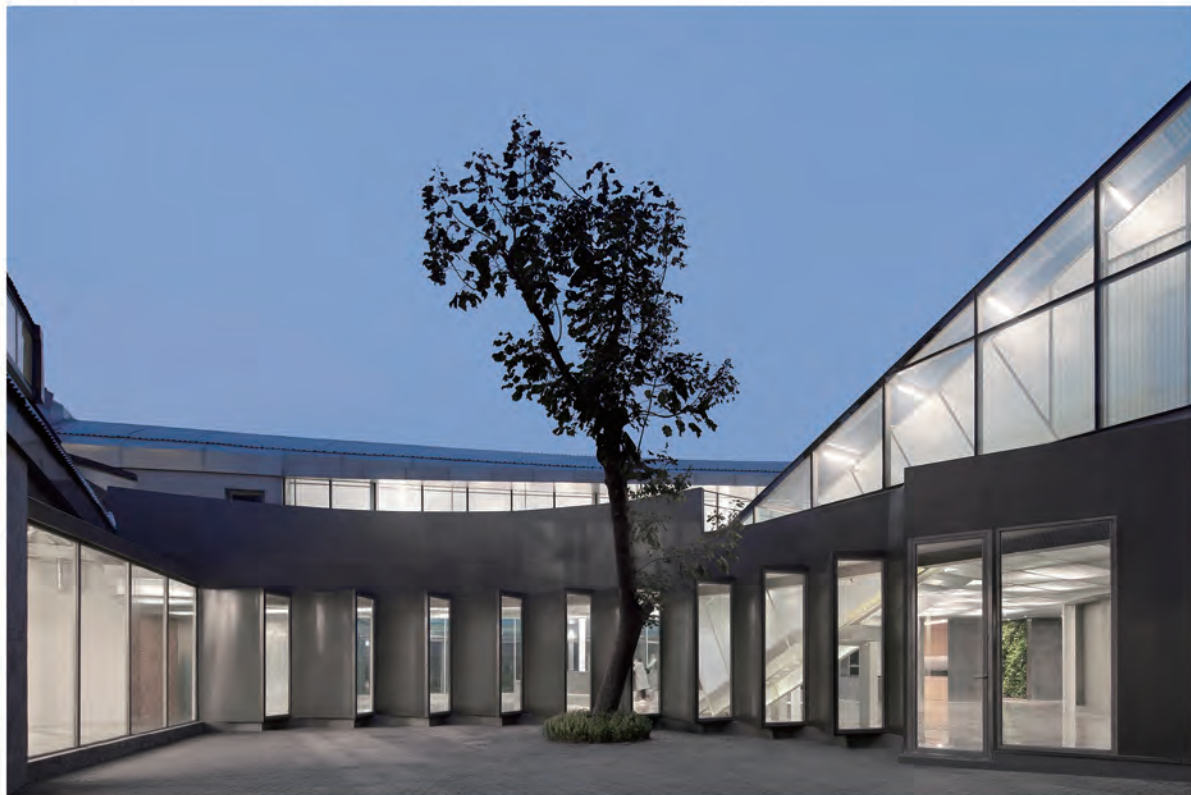
车站内院弧形墙面 / Arc wall of the inner courtyard of the station