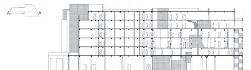
二期 AA 剖面 / AA Section of Phase II