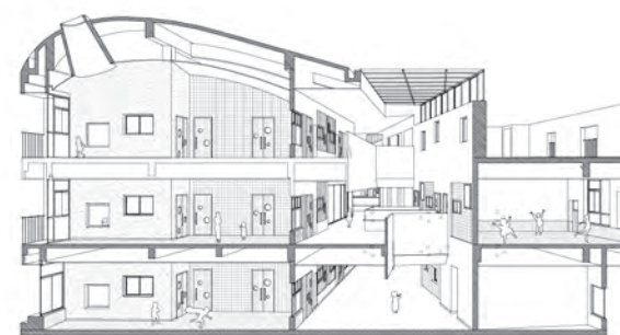
剖透视 / Sectional perspective